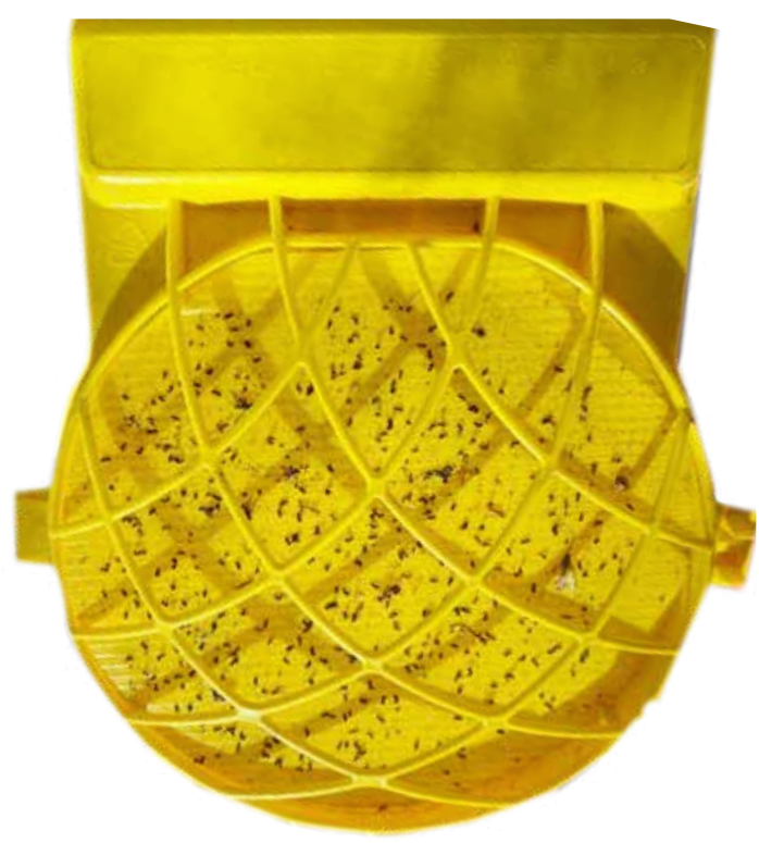
Figure 3. CGW on a Fruition Garden Citrus Gall Wasp Trap

Fruition Garden Citrus Gall Wasp Traps can be used to monitor for wasp emergence in the spring. CGW emergence is based on a measure of day degrees, generally from June 1st. In the northern citrus areas, emergence will occur earlier than in the southern areas, but it can vary each year. A tool to accurately indicate emergence is a valuable resource in the management of CGW. The patented lure system in Fruition Garden Citrus Gall Wasp Traps is designed to attract adult CGW