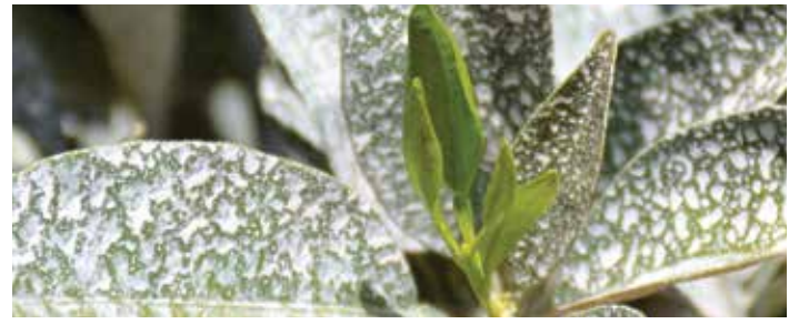
Figure 1. Surround on citrus leaves